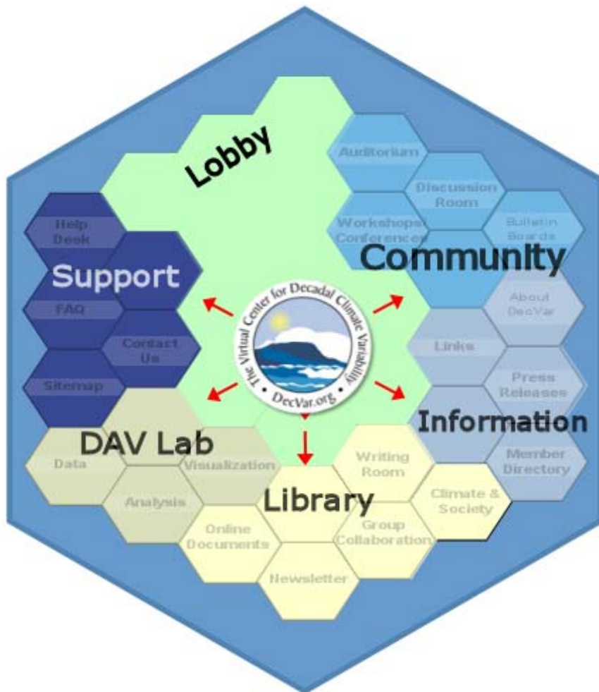
Figure 1: The DecVar.org home page. Each hexagonal section represents a single system module

long runs of Earth System models for simulation, data assimilation, and predictability studies. A Web-based Center can make the output from model runs immediately available to researchers irrespective of their physical location. Data sets and analysis and visualization systems built into